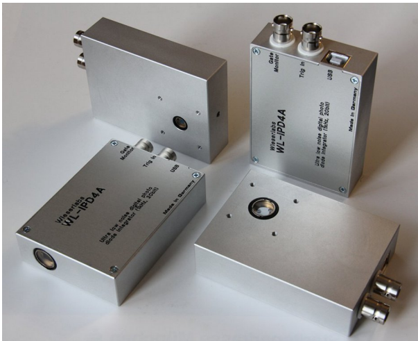
Different typical configurations (single-channel).

The information provided in this data sheet is believed to be accurate and reliable. However, no responsibility is assumed for its use, for inaccuracies and omissions, nor for any infringements of patents or other rights of third parties that may result from its use. Prices and specifications are subject to change without notice. Trademarks and registered trademarks are the property of their respective owners.